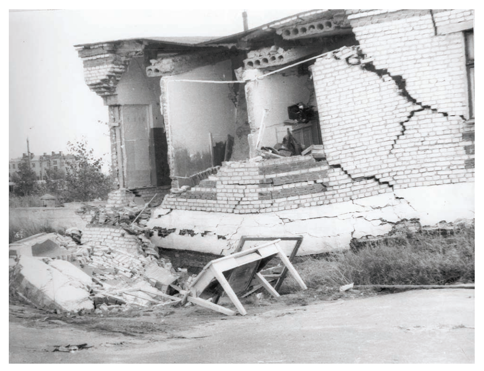
Figure 2. Karst collapse (d≈12 m) in Dzerzhinsk. One more example of building without constructional antikarst protection (Russia), 1970.

International Conference "Natural Hazards - Links between Science and Practice"