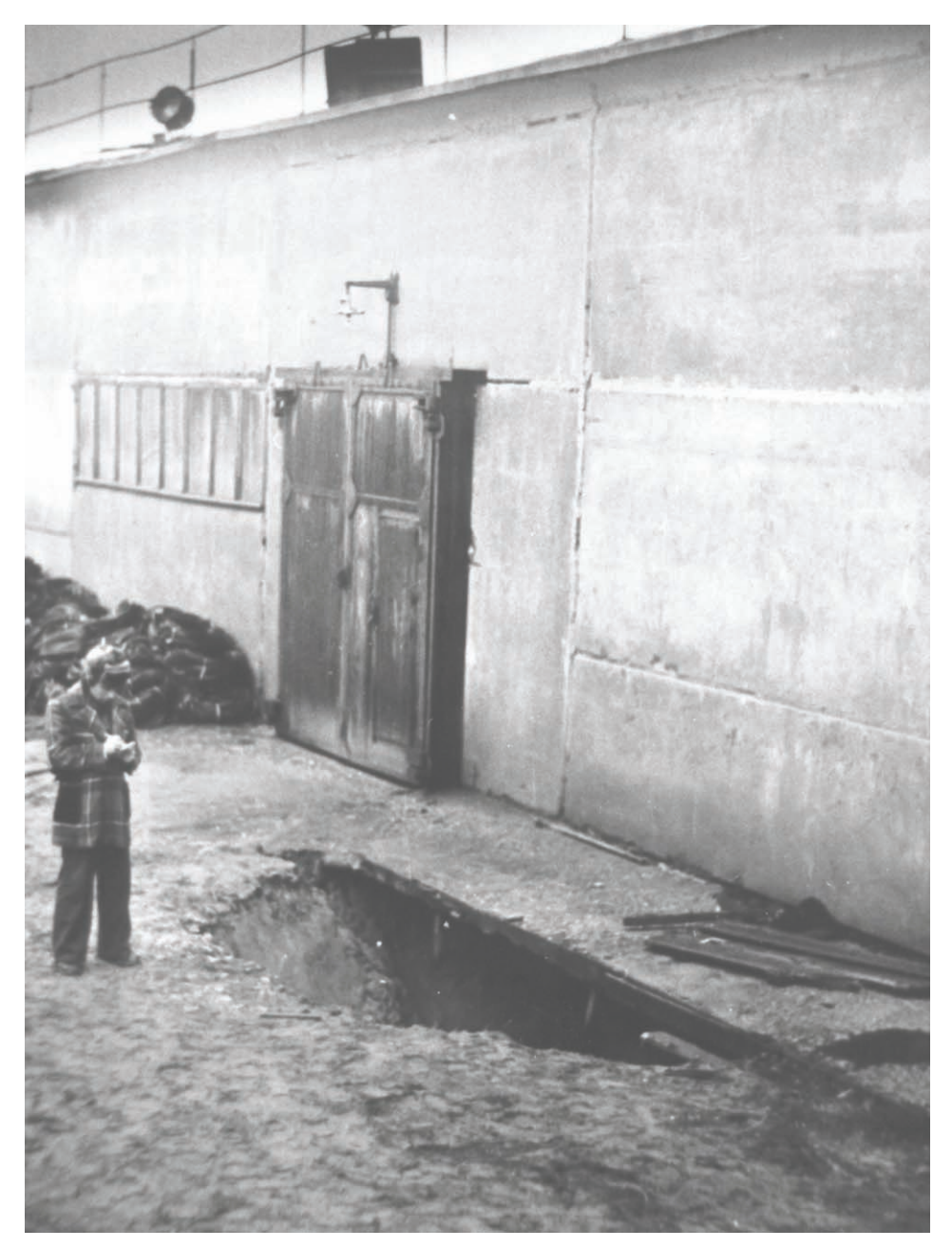
Figure 4. A case of efficient constructional antikarst protection (Russia). The building with a karstproof foundation sustained a sinkhole d≈6m, (1970).

(a man in the photograph - Koposov E.V.)