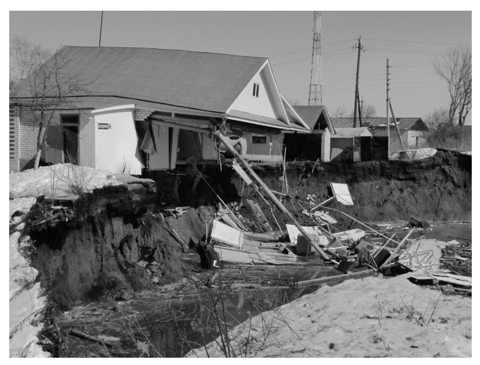
Figure 3. Karst collapse (d≈60 m) in Buturlino (Russia), causing destruction of two residential buildings and a granary in April, 2013.