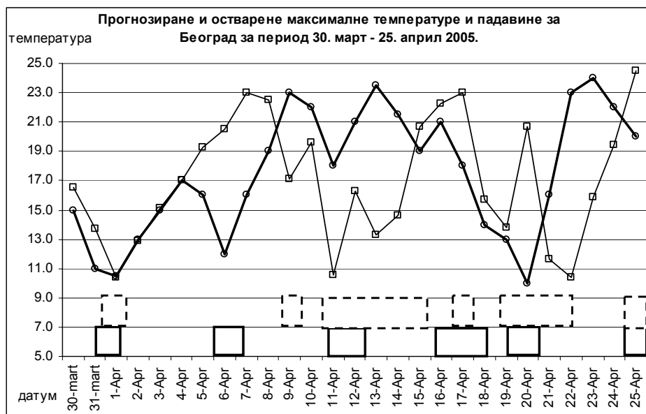
Figure 2. Forecast of maximum temperatures (values connected by full thick line) and days with rainfalls (rectangles at the bottom of the graph marked with full line) for period March 30 th to April 25 th 2005 for Belgrade and the surrounding area. Measured values of maximum temperatures are marked with thin full line, and period with rainfalls with rectangles with broken line

The forecast shown on fig. 2. has been done on March 20 th , i.e. 10 days before period on which it refers to. Period of 27 days has been studied, i.e. one meteorological month, which length approximately corresponds to differential rotation of the Sun.