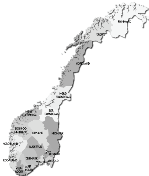
Figure 5. Regions in Norway (AER, 2010b, page 174)

After these two reform processes, Norway had 19 districts and 430 municipalities. Each district was represented by regional agency of the central government and representatives of local entity's institution, elected by local population. These bodies had their own autonomy, budget and the right to collect taxes, which was the main reason for initiation of reforms in 1964. Aim of the reform was to separate these two functions of the district, but also to distribute tasks, functions and finances among three levels of government (central government, districts and municipalities).