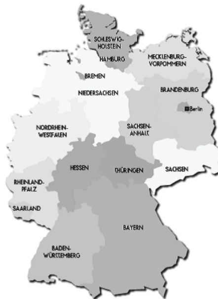
Figure 2. Regions in Germany (AER, 2010b, page 87)

directly controlled by the central government. Nowadays, Germany has 16 regions - Länders , out of which 5 had been joined from the former Democratic Republic of Germany after the fall of the Berlin wall. All regions have completely developed independent legislature, their own executive and judicial bodies. Jurisdiction of the federal government and Länders are defined by the Federal Constitution – Grundgesetz .