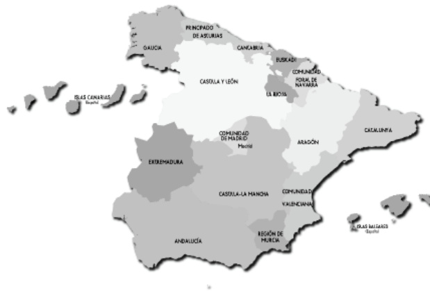
Figure 6. Regions in Spain (AER, 2010b, page 215)

After 40 years, Spanish Constitution created autonomous community – regions in Spain. According to this Constitution, there are three levels of government in Spain: central, regional – autonomous communities and local authorities. Spain has 17 regions: Andalusia, Aragon, Asturias, The Balearic Islands, Baskia, The Canary Islands, Cantabria, Castile and León, Castila Castile-La Mancha, Catalonia, Extremadura, Galicia, La Rioja, the Madrid region, Mursia, Navara and the Valencia region. Local authorities comprise of 50 provinces and over 8000 municipalities.