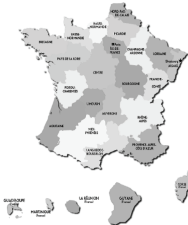
Figure 4. Regions in France ( AER, 2010b, page 71)

agricultural activities), local authorities have played the fundamental role in promotion of regionalisation. Local authorities have influenced many regional reforms with their wish for quicker economic development and promotion of their regions during 1980's. Last constitutional reform in 2003 has confirmed statute of the region as territorial authority with full capacity. Today France has 22 regions on its territory and 4 over-sea regions (Guadeloupe, Guyane, Martinique and Réunion).