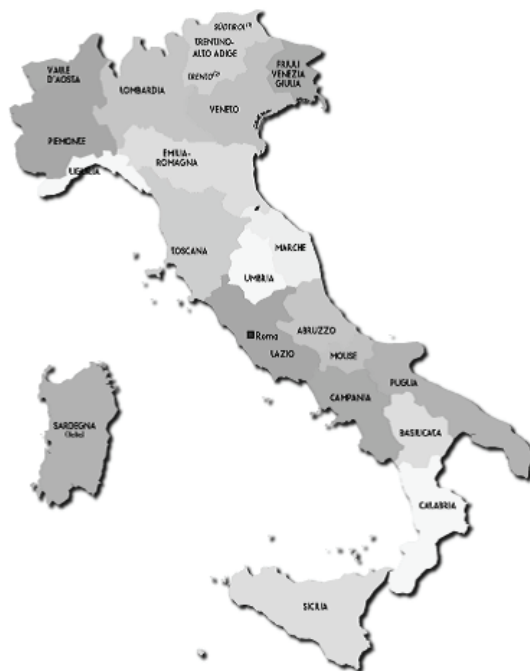
Figure 3. Regions in Italy ( AER, 2010b, page 119)

In spite of the incipient enthusiasm, implementation of the regional policy and the results were very modest, mostly due to the lack of financial support, mutual functions with the central level (functions which should be done independently were shared with the central government), political resistance to decentralisation by the opposition, centralist mentality, etc. That's why the second phase of regionalisation – regional reform – had started in 1970. This reform gave much higher empowerments to regions in the sphere of social services, regional planning and economic development (Cassese & Torchia, 1993). Besides direct regional benefits, regional reform has also strengthened Italy with modernisation of the new laws and administration and also strengthening of the democracy. Italy then gained 15th region - Friuli Venezia Giulia .