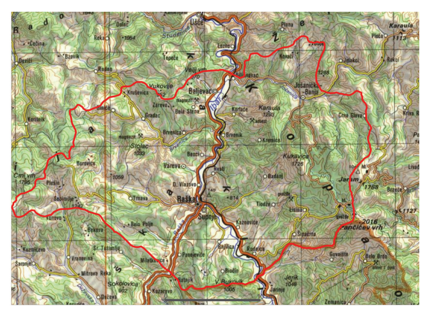
Map 1. Map of the Municipality of Raška