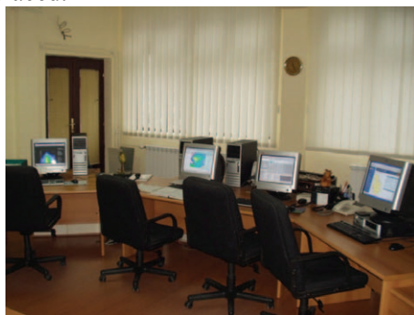
Figure 3. Work area of the radar center

The main workstation controls work of the radar, collects and processes data, the second workstation is for determining seeding zone, and third workstation is for work with shooters - more exactly determination of commands for an action.