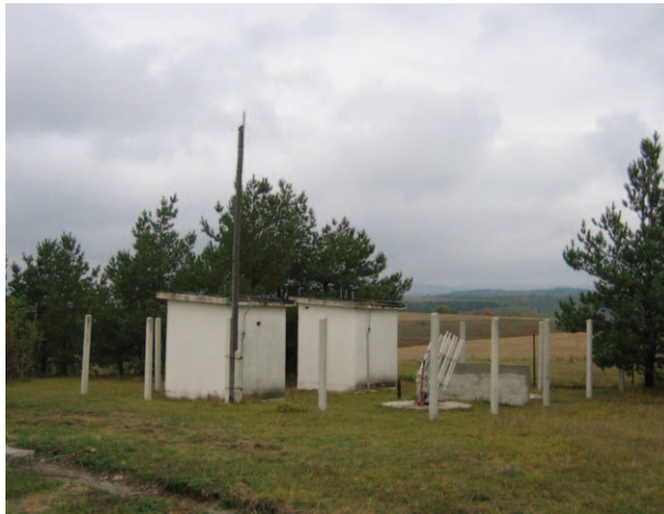
Figure 4. Anti-hail station

From multi-pipe launchers, by command from the radar center, elements are set for rocket launching: direction and elevation. For each type of rocket determined ballistic curves exist for different elevations.