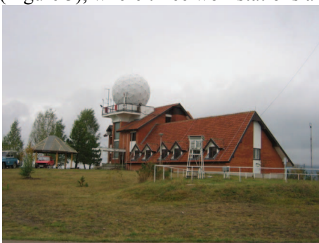
Figure 2. Radar center "Sjenica"

One of radar centers located in the area of Sjenica was shown in Figure 2. At each radar center there is a meteorological radar and a typical operating room (Figure 3), where three workstations are placed.